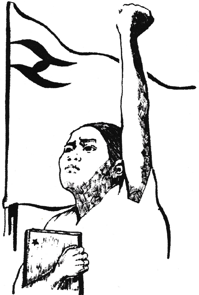
Illustration from the program of the July 1973 KDP Founding Congress